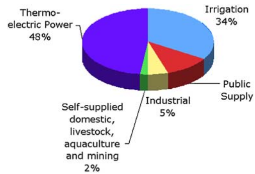
Fig. 1 Estimated water usage by sector in the United States in 2000 (Berndes 2002)

Internationally, several assessments suggest that up to 2/3 of the global population could experience water scarcity by 2050 (Vorosmarty et al. 2000; Rijsberman 2006). These projections demonstrate that human demand for water will